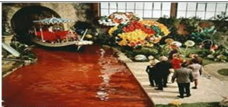
In Willy Wonka's Chocolate Factory each room is named after a product, for example "The Chocolate Room", The Bubblegum Room etc.

What other rooms can you imagine? Which would you like to explore? Discuss your ideas and write about them.